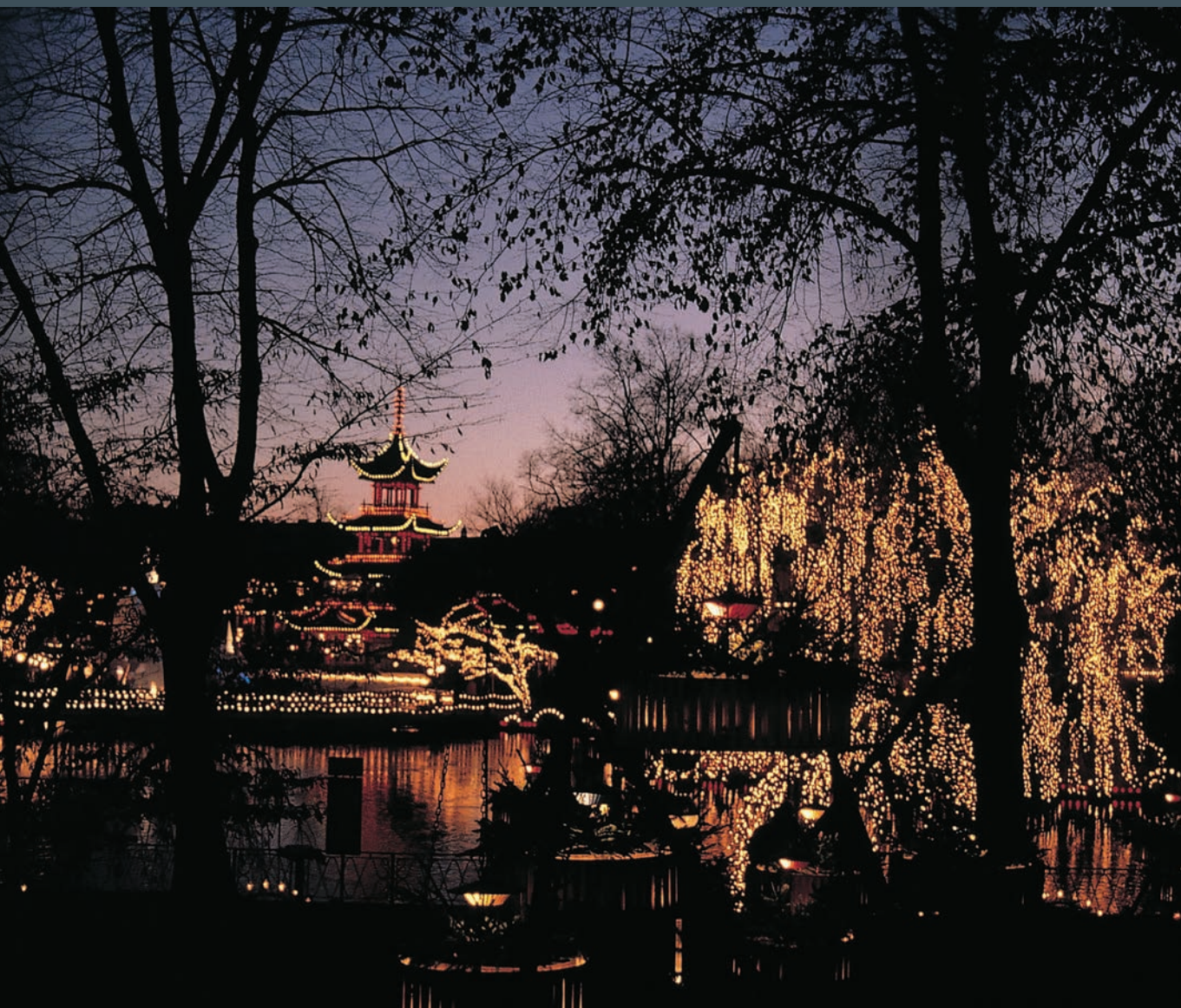
Night view of Tivoli Gardens.