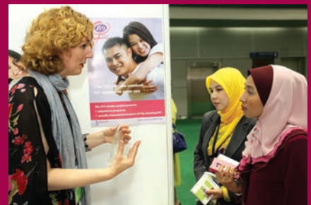
Attendees of the Women Deliver 2013 Conference in Malaysia enjoying a lively Career Fair