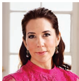
Crown Princess Mary of Denmark

A s patron of the Women Deliver 2016 Conference in Copenhagen, Denmark, I am honored to welcome you to this truly significant event, and to have the opportunity to participate in what is sure to be an inspirational, powerful, and game-changing conference.